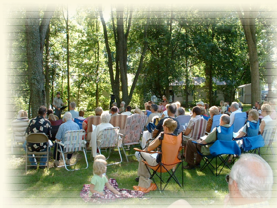
CHURCH IN THE PARK Outdoor Service