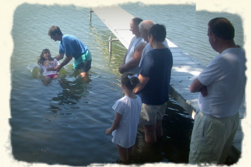
A BAPTISM AT GILEAD LAKE

As a congregation, we are actively involved in reaching out to others in our community. We desire to share Gods love and concern, in tangible ways so that others can discover and experience a life altering relationship with Jesus Christ.