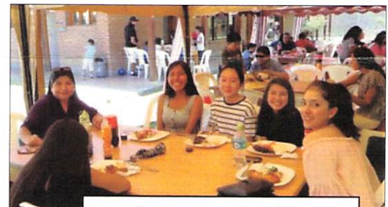
Students, staff, and parents came together at our back-to-school barbecue in February.