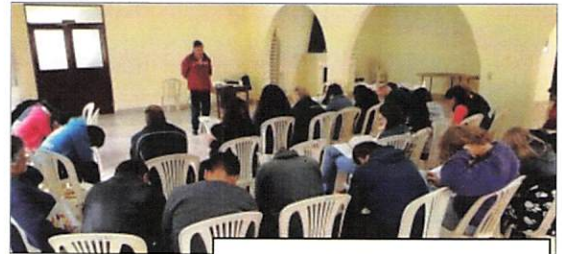
By Prayer ... at the CCS staff retreat in January