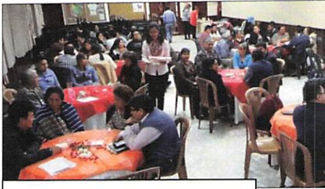
We put together a romantic Valentine's dinner to kick off the couples' ministry for 2019.