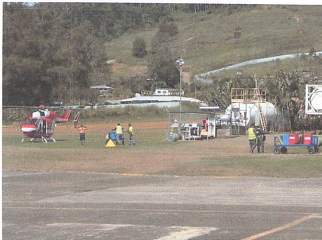
Ballot Boxes Being Flown to Remote Areas

This past July elections were held around the country. Several of you read the public statement issued by our directors, and have been praying about the election-related violence that has occurred in several parts of PNG as well as here in the Aiyura valley. Through your prayers, the PNG Defense Force, police, and local churches were able to stop the fighting in our valley from continuing. Things were tense around the valley for a couple weeks. Please pray for the leaders to make progress on the steps for the peace process.