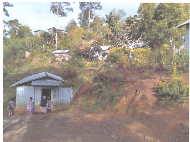
Church Sunday Morning