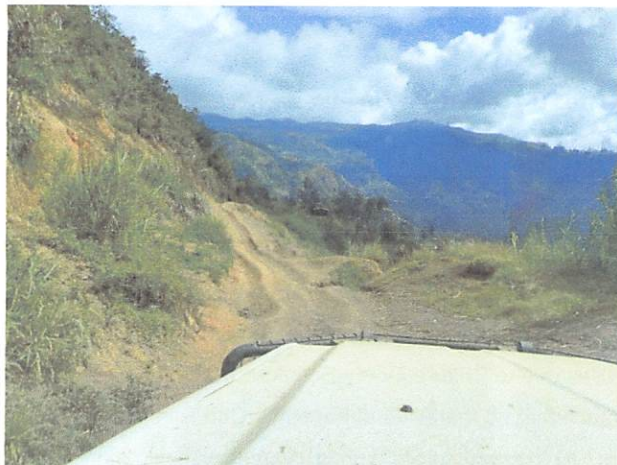
Road Travel Around Aibai